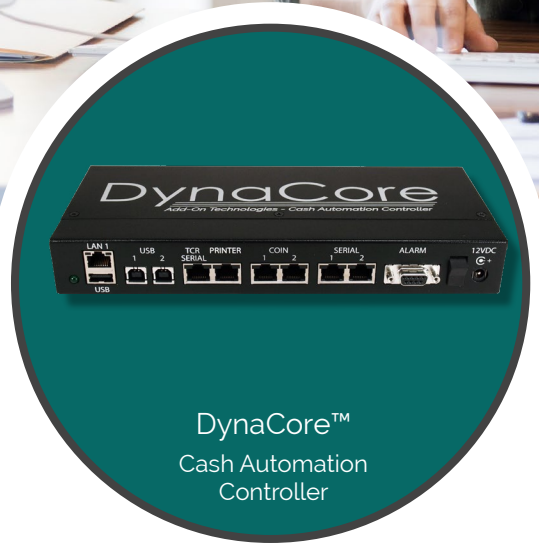
DynaCore™ Cash Automation Controller