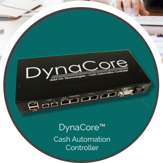
DynaCore™ Cash Automation Controller