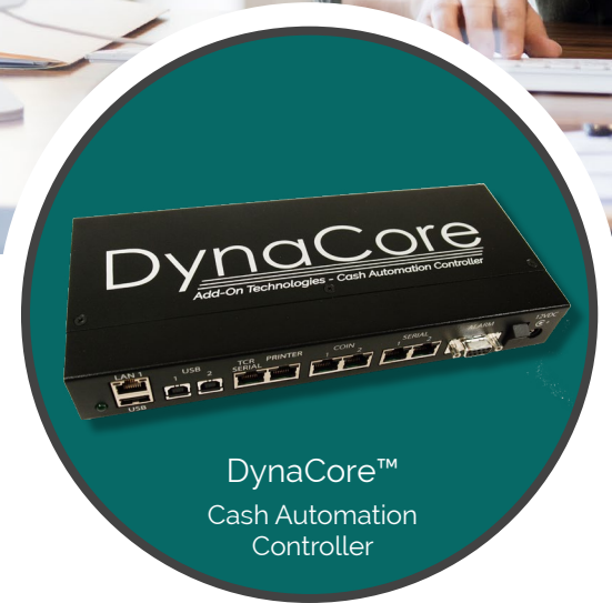
DynaCore™ Cash Automation Controller