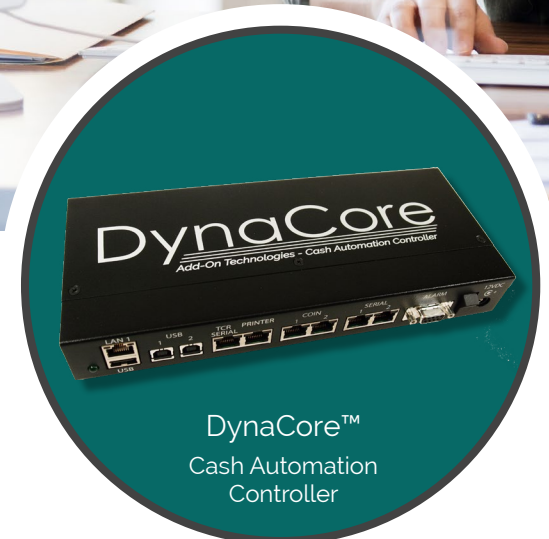
DynaCore™ Cash Automation Controller