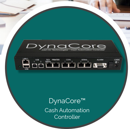
DynaCore™ Cash Automation Controller